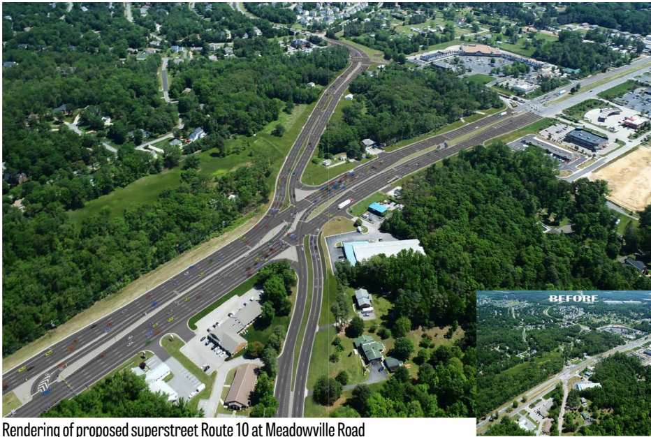
Rendering of proposed superstreet Route 10 at Meadowville Road

From improving roadways to encouraging the rehabilitation of older neighborhoods, to providing more opportunities at local libraries, Chesterfield is dedicated to ensuring communities thrive, while responsibly caring for the environment.